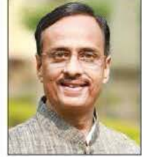
Dr. Dinesh Sharma Deputy Chief Minister Uttar Pradesh