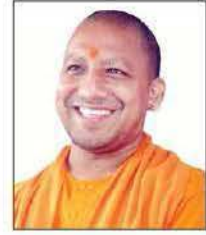
Yogi Adityanath Chief Minister Uttar Pradesh

No.-823/78-2-2021-254 L.C/2019TC Lok Bhawan, Lucknow-226001 Date : 09 April 2021